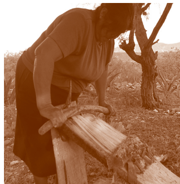
A cooperative member prepares the agave plant after harvesting

We are excited to announce that IDEX has a new partner in Mexico, Ñepi Behña (Women of Dignity). Ñepi Behña works with over 650 indigenous women in the state of Hidalgo. Their goals are to promote gender equity and empower women to build strong livelihoods.