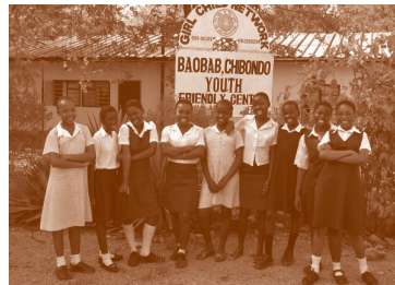
Students at one of GCN’s many girls’ clubs