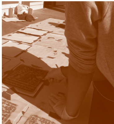
The Oxford Academy NGC team highlighted issues in Nepal with key data. Students also made prayer flags.

The team started with weekly meetings to encourage fellow students to become involved. Around Thanksgiving they